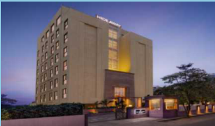
THE HIDEWAY (HOTEL) Located at Knowledge Park I, Greater Noida