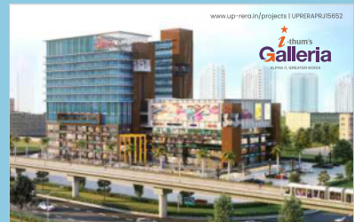
ALLPHA II, GREATER NOIDA