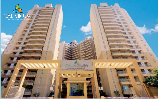
SECTOR-109, GURUGRAM | 3 & 4 BHK APARTMENTS & PENTHOUSES