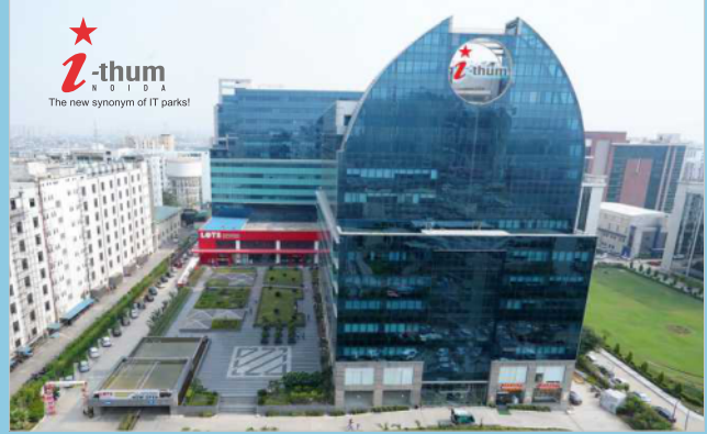
IT/ITES/COMMERCIAL | SECTOR-62, NOIDA