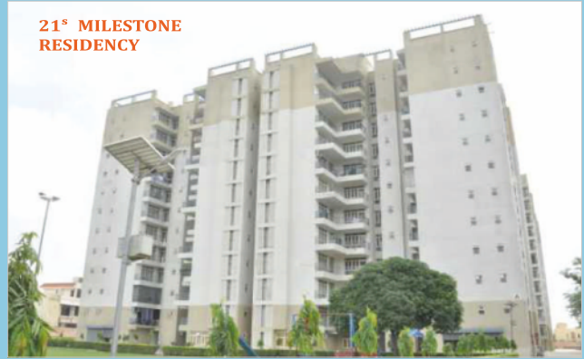
RAJNAGAR, GHAZIABAD | 2 & 3 BHK APARTMENTS