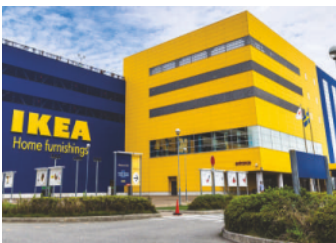
IKEA is all set to begin work of its biggest store in Noida