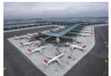
Jewar International Airport