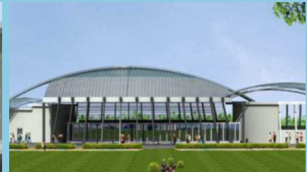
ICE SKATING RINK & INDOOR STADIUM Located at Raipur, Dehradun, Uttarakhand