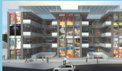
DELTA CITY CENTRE (SHOPPING CENTRE) Located at Sector Delta-1, Greater Noida