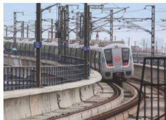
Noida Sector 52 - Metro Hub Smooth Connectivity to entire Delhi NCR