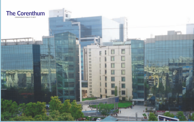
CORPORATE PARK | SECTOR-62, NOIDA